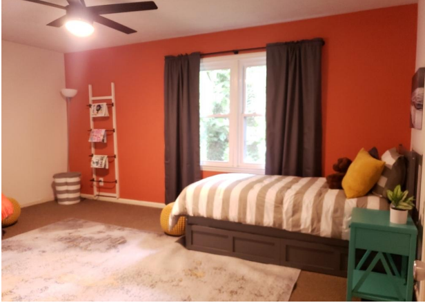
Finished Bedroom 3