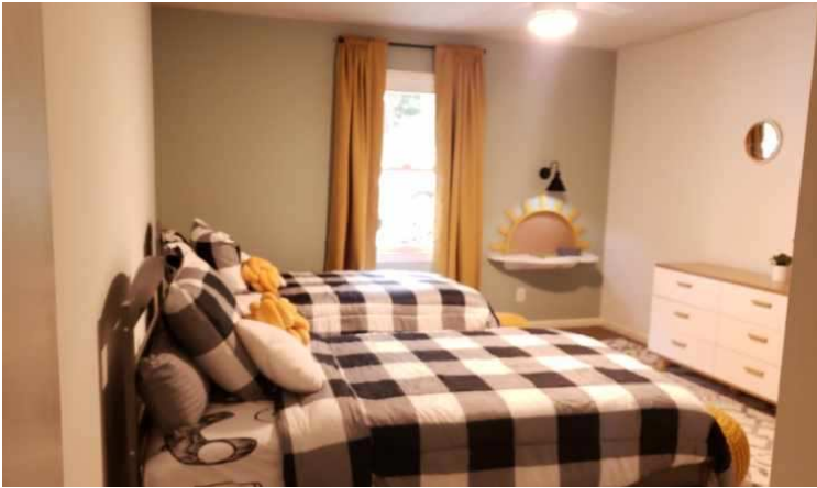
Finished Bedroom 1